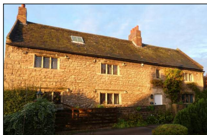
Home Farmhouse, Hooton Pagnell