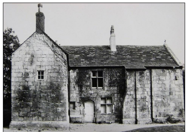
The Old Rectory, Campsall.

estate village with great views from its ridge location. The owner of seventeenth century Home Farmhouse has agreed to let us record it (not been recorded before) – gable-on to the street with a three-room plan.