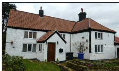
Manor House, Austerfield