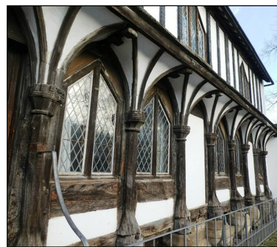
One of Tickhill's more unusual buildings: St Leonard's Hospital dating from 1470 on the ground floor.

We are based at the Holiday Inn Junction 36, Doncaster; easy to get to without going into the centre of Doncaster, just half a mile off the A1M – see booking form enclosed with this Newsheet. Last year we recorded buildings with two-cell plans with rear aisles or outshuts. This year we record L-shaped seventeenth century and earlier buildings including brick houses, one featuring Tudor diaperwork at Low Grange, Thurnscoe, just over the border in Barnsley MBC, and another at the Manor House, Austerfield (near Bawtry), where brick encases the timber-framed home of Pilgrim Father William Bradford born here in 1589. He famously sailed to America on the Mayflower in 1620, becoming Governor of Plymouth Colony in 1621; the house is now a feature of the Pilgrim Trail but has never been previously recorded.