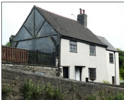
Kirkness Cottage, 35 Briggate (YVBSG 0038). A small timber-framed house, possibly mid 16th century with truncated principal rafter roof.