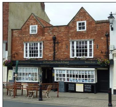
16 Market Place (YVBSG 0262). Part of a row ‘new-built’ in 1625. Timber-framed, stairs with splat balusters. Mid 18th century shop window.