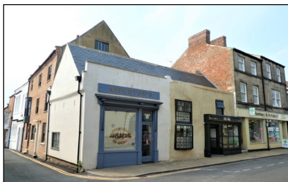
46 Market Place (YVBSG 0515 and 1873). A timber-framed building with gable of king-post form with V-strutting indicating a late 16th or early 17th century date, although internal features suggest a mid 16th century date.