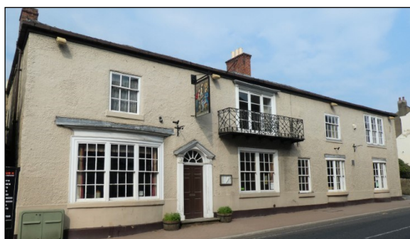
Commercial Hotel, High Street (YVBSG 0180). The early 19th century façade of this complex building hides the remnants of a timber-framed building including a beam decorated with early 16th century painting. A hollow-chamfered and broach-stopped cross-beam probably date from the late 16th century.