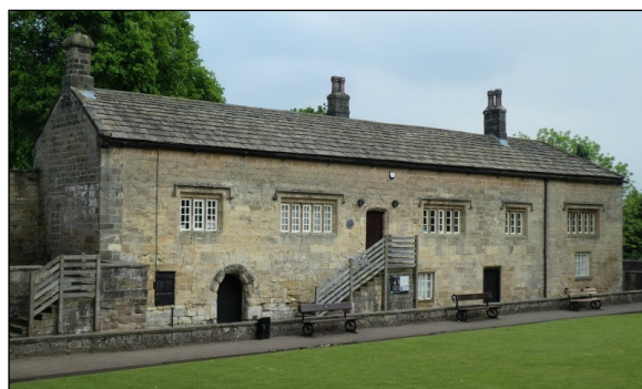
Old Courthouse (YVBSG 0201). A well-documented building standing within the walls of the castle, dating from the 14th century onwards.