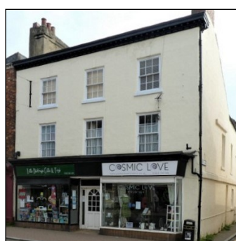
47 High Street (YVBSG 0397). This apparently late Georgian house contains the remains of a late medieval timber-framed house. Inside is a splendid ogee-arched doorway. Evidence exists of an infill of limestone chips between posts.