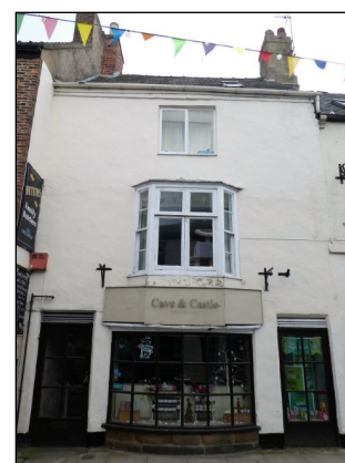
11 Castlegate (YVBSG 0163). Early example of post-timber-frame construction. Probably c1720 and designed as a shop. First floor reputed to have been used as a cockpit.