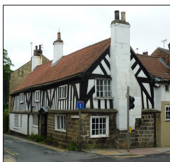
St John’s House, Church Street (YVBSG 0039). Probably 16th century with stone walling on ground floor and timber-framing above. King-post roof with V-struts. Large gritstone fireplace inserted early 17th century.