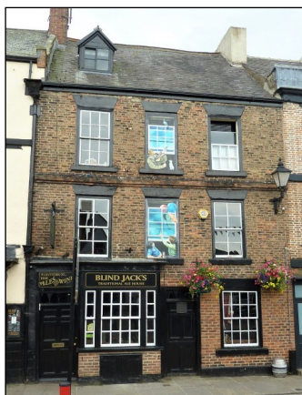
19 Market Place (YVBSG 1096). Part of a row of six shops said to be ‘newly built’ in 1611. Originally timber-framed and of two storeys, raised to three storeys with lofts in the late 17th century.