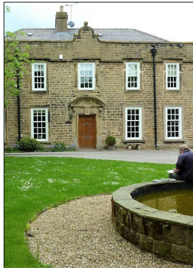
Recording Bramley Grange, Rotherham

After last year's successful autumn day school event, when we promoted our review day more widely, we have decided to do this again. Our usual venue at Leeds Beckett University was not available to us so we have decided to hold it at the Showroom Cinema in the centre of Sheffield, just a few minutes' walk from the railway station; this is more convenient for the owners of the buildings we recorded to attend. This is an excellent venue used by South Yorkshire Archaeology Service for their annual day schools. It was only available for the morning until 12.30pm, giving us just five half-hour slots, sufficient time for our team leaders to talk about the five carefully chosen buildings reflecting different periods that were recorded at our earlier Rotherham recording weekend held in May, as outlined in the booking form enclosed with this Newsheet