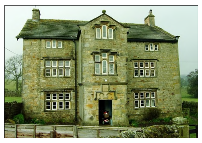
Alder House Farm

Meet 10am at village car park (12 spaces), toilets here. Parking also around two village greens. Directions: from the busy A59 Skipton to Clitheroe road, watch out for signposts to Bolton-by-Bowland at Gisburn and Sawley.