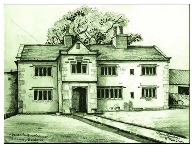
Bolton Peel Farmhouse