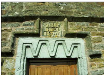
Doorhead of 1700

A return visit to this most interesting farmhouse which lies to the east side of Stocks Reservoir in the historic West Riding of Yorkshire. Owned by the Forestry Commission, there are six decorated doorheads, of which three have dates of 1662, 1672, and 1700; two of them have long inscriptions. The upper storey of the one-and-a-half storey porch oversails slightly.