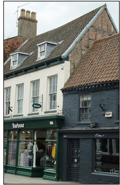
Timber-framed gable at 9 North Bar Within