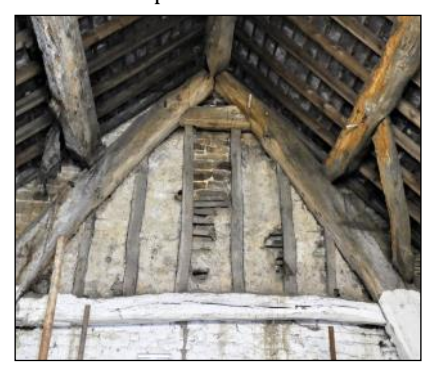
The cruck-framed Oak Fold Barn in Shiregreen, Sheffield, perhaps early 17th century with later alterations.

This issue will cover the weekend conference held at Sheffield in the far-off days of 2019 when such events were possible. We gave it the title of 'Hallamshire and the Dark Peak', which was rather more alluring than 'Sheffield and Environs' (no offence to Sheffield) which we could have used. The rural area has long been renowned for the survival of numbers of cruck-framed buildings, some of which will feature in this issue, while within the City of Sheffield are some surprising survivals from its rural past.