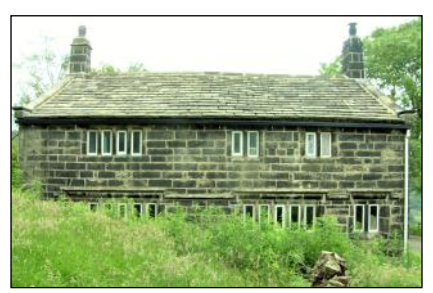
Flail Croft, with the glazed openings between the right-hand upper windows

over the housepart, and then glazed. This was due to a window tax, first imposed in 1696, then augmented from 1747 to 1808, reduced in 1825. Finally repealed in 1851. For tax purposes, two windows became one, as long as the stones between the 'false window' and real window were no more than twelve inches wide.