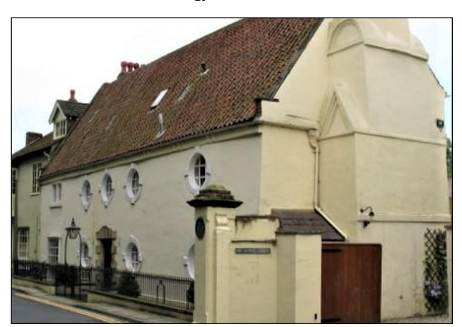
St Agnes House

The next-but-one house, 16 High St Agnesgate, is the distinctive looking St Agnes House. (NYCVBSG 127) The large ornate external chimney stack dominates the west gable and the front façade is famed for the circular windows faced with flat stone. The north-south range contains three king-post trusses. Dendrochronology results indicate the trees were