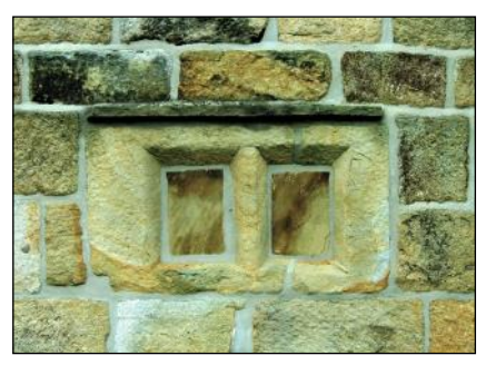
The small mullion window

The outline of an earlier lower building can be seen in both of the gables, probably late seventeenth or early eighteenth century. The walls were then raised in the early nineteenth