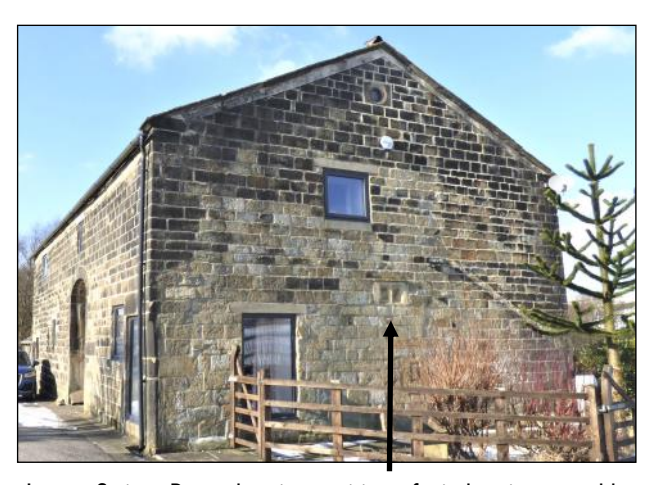
Lower Strines Barn, showing position of window in east gable

century, including a venetian window to the north elevation, typical of many early nineteenth century barns in the area, some dated.