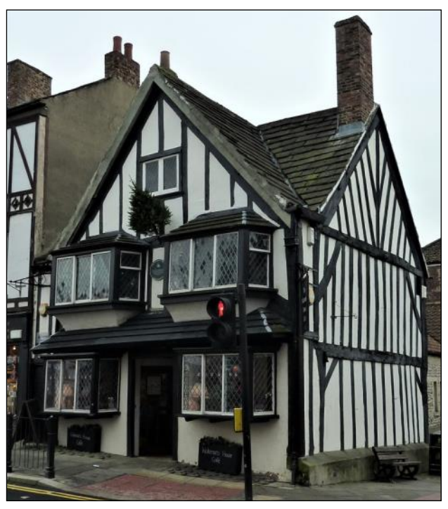
The Wakeman's House

The Wakeman's House 'main roof runs parallel to the street. The diagonally-set ridge piece is supported by three principal trusses which also carry two pairs of trenched purlins with windbraces to the upper pair. Both the end trusses have a striking pattern of diagonal studding and a central kingstrut.' (NYCVBSG 111)