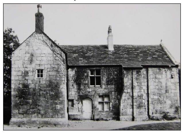
The Old Rectory, Campsall.

estate village with great views from its ridge location. The owner of seventeenth century Home Farmhouse has agreed to let us record it (not been recorded before) – gable-on to the street with a three-room plan.