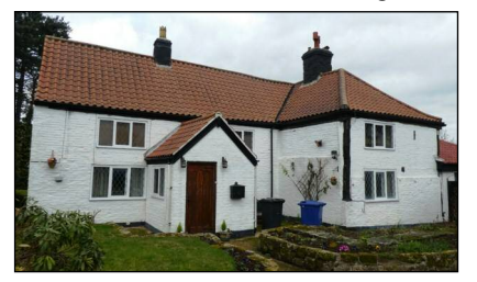
Manor House, Austerfield