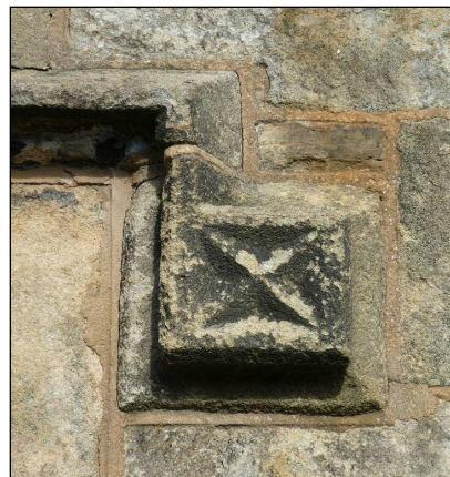
Manor Farmhouse, Upper Midhope