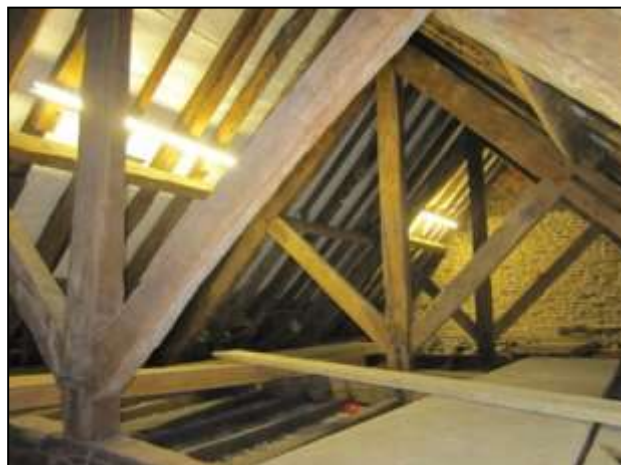
King-post roof trusses above the Guildhall Magistrates' Room

Looking forward, further recording work will be done at the annual conference in May (details with this Newsheet). Later in the year we hope to arrange another recording day to cover individual features in some buildings where it is not possible or practical to survey the whole building.