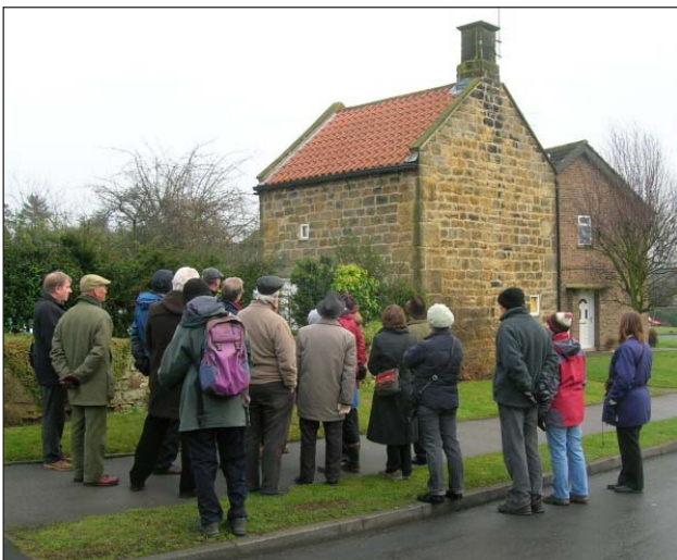
Participants ponder the purpose of an unusual small building with very few windows during the walk around East Keswick.