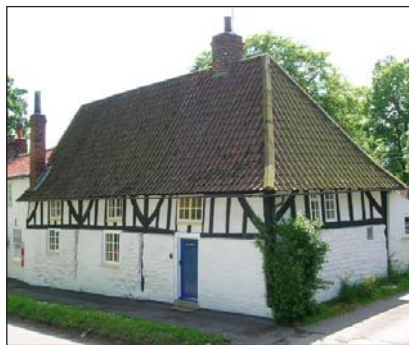
Oak Cottage, South Dalton

We expect to draw recording resource from our membership across the whole of Yorkshire if and when it comes to surveying the buildings, and we will publicise these opportunities when they arise. However, if you are also interested