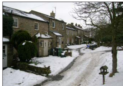
Carlton-in-Coverdale in the snow

This year we return to the Yorkshire Dales for our annual conference, which will be based in Carlton-in-Coverdale. A booking form providing full details is enclosed with this Newsheet.