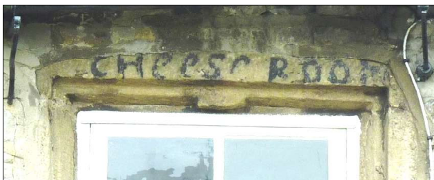
Window at Harden Cottage

On a somewhat chilly day in June members from as far away as Staffordshire, York, Northallerton and Chorley met in Austwick for a walk around this Craven village led by Kevin Illingworth. During the walk we were invited into six or more gardens for a closer look at the buildings, which offered much of interest. External and corbelled stacks were much in evidence, as were full-height internal flagstone partitions, one of which could be glimpsed by peering through the window of an empty property. Most of the older buildings were constructed of rubble apart from Backfold, a house of coursed limestone with a splendid doorhead of 1712 and carved dripmould stops. At Harden Cottage (dated 1719), the words 'cheese room' over a formerly-mullioned upstairs window led to much discussion – was it really a cheese room, and if so, was it unusual to find one on the first floor? Some