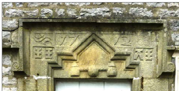
Lintel at Backfold

subsequent reading-up revealed that, according to Brunskill ( Houses and Cottages of Britain ), a cheese chamber or room was 'sometimes in the loft space and sometimes at first-floor level, where its window was exempt from Window Tax under the same concession as for the dairy. Cheeses were stored and cured here.'