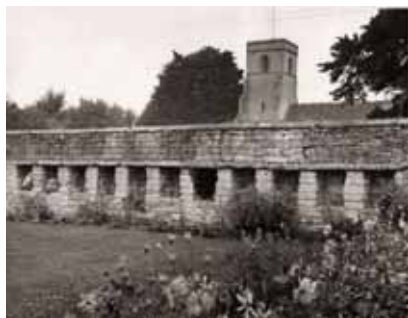
Row of bee boles, Lovington, Somerset (No. 0131)

The IBRA Bee Boles Register database, which contains 1370 records and over 1100 images, can now be accessed online (free) at www.ibra.org.uk/beeboles . Searching is easy, and selected records and images can be viewed. In addition, a list of relevant publications is provided. The site will be of special value to local historians