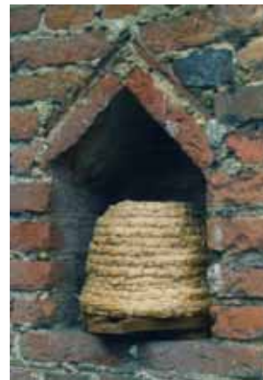
Skep in brick bee bole, Quebec House, Westerham, Kent (Register No. 0078;)

throughout Britain and Ireland who are interested in our beekeeping heritage and in vernacular buildings. It could also be useful for school or college projects.